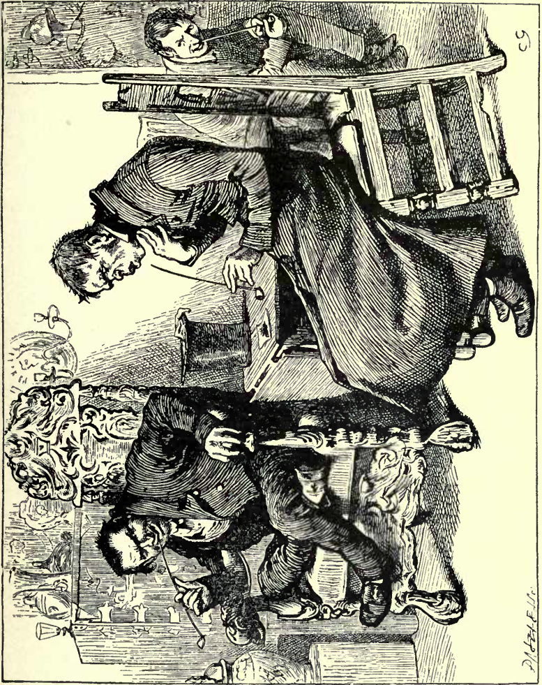
"IS IT GOOD, BRASS, IS IT FRAGRANT?"